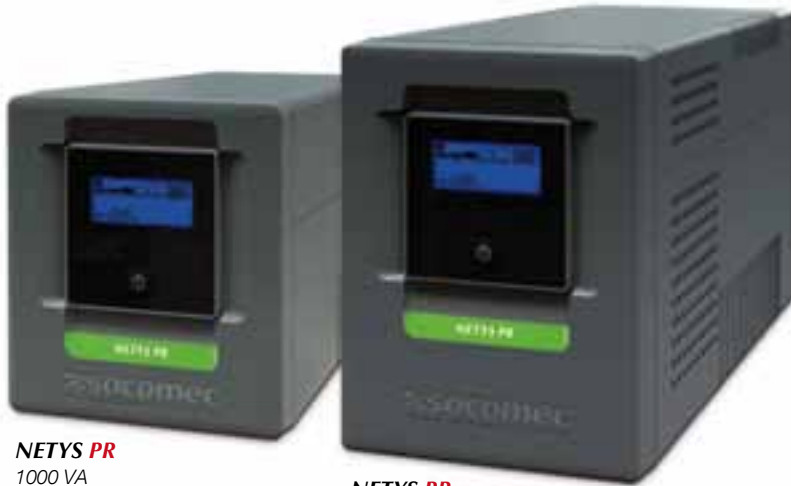
NETYS PR 1000 VA